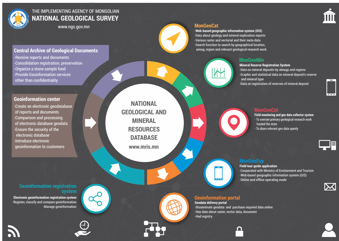
Figure 1: How the National Geological Database works. Source: National Geological Survey, Mongolia